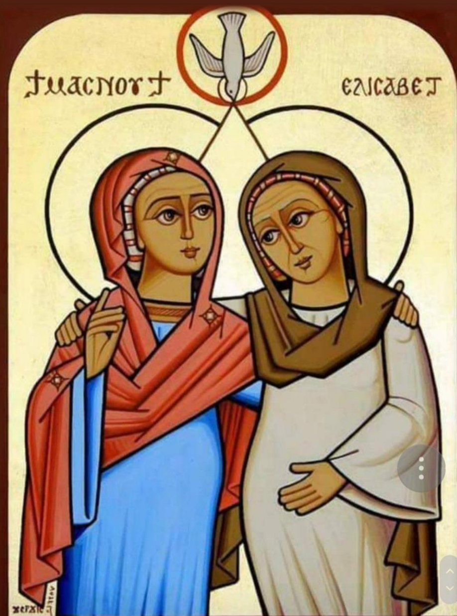
أيقونة زيارة والدة الإله مريم لوالدة المعمدان اليصابات