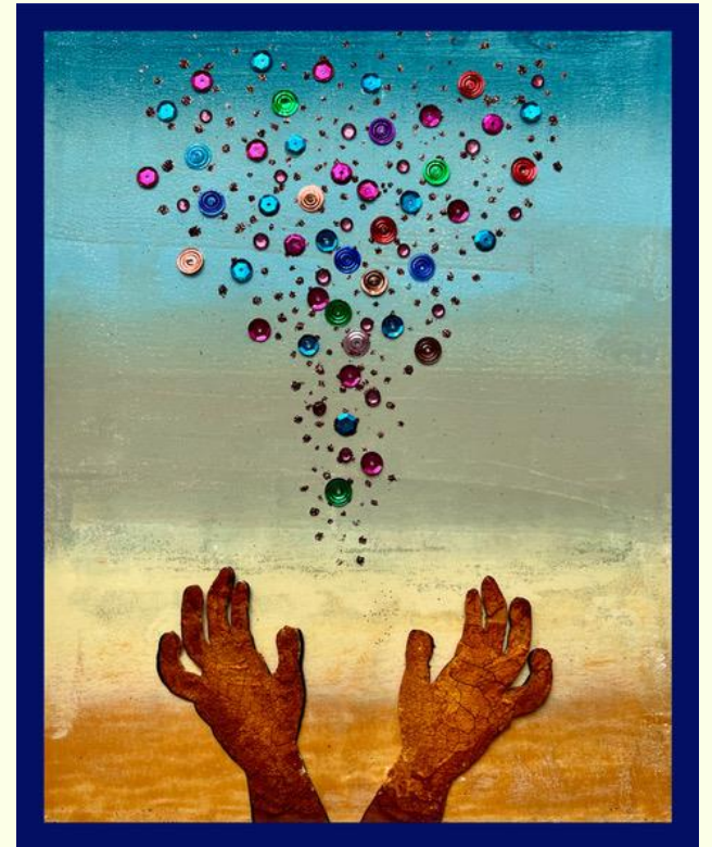
Art by Sue Carroll