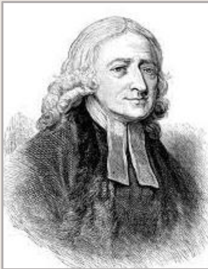
John Wesley 1703 - 1791