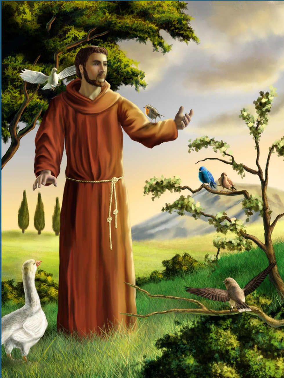
St. Francis of Assisi