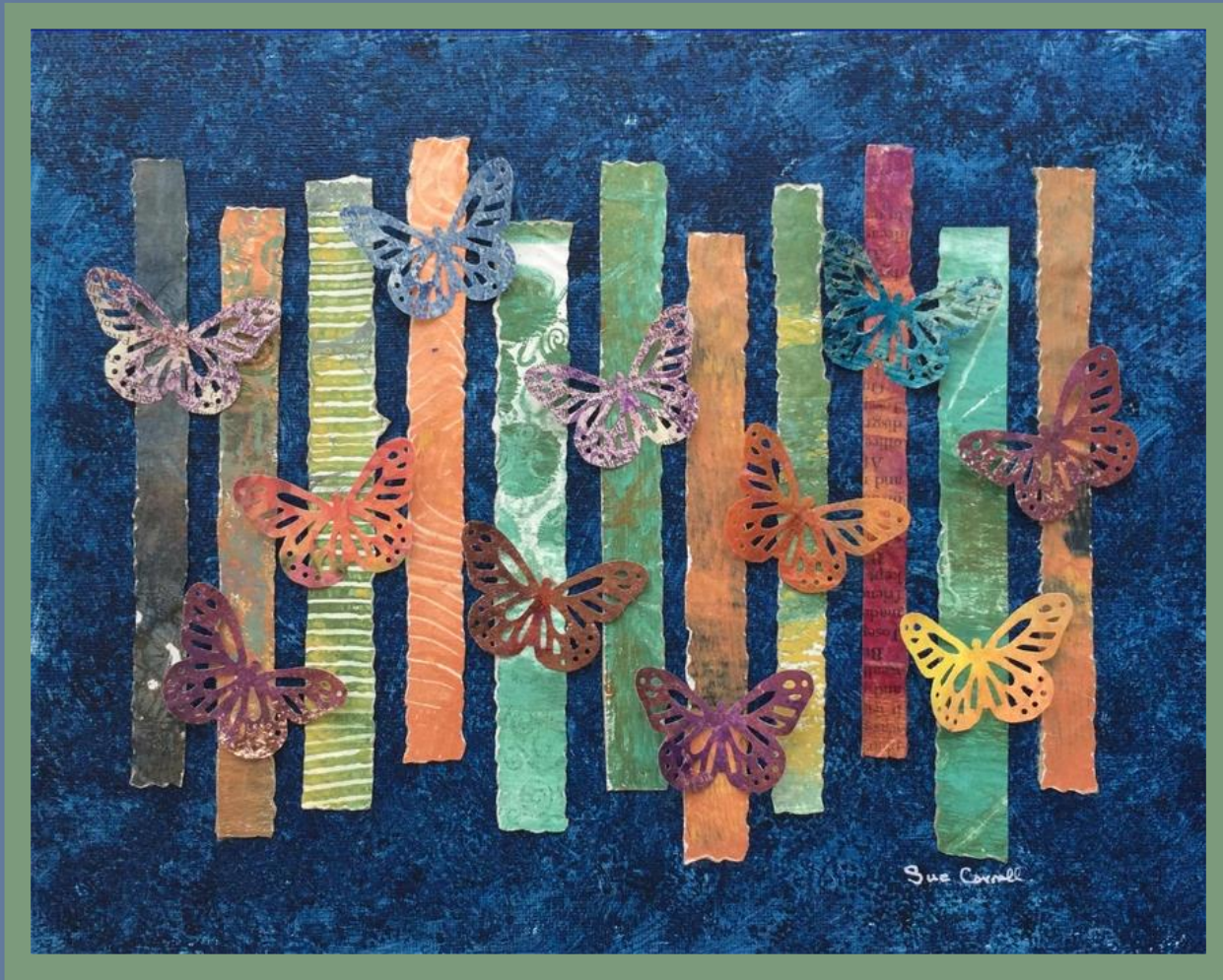
Art by Sue Carroll